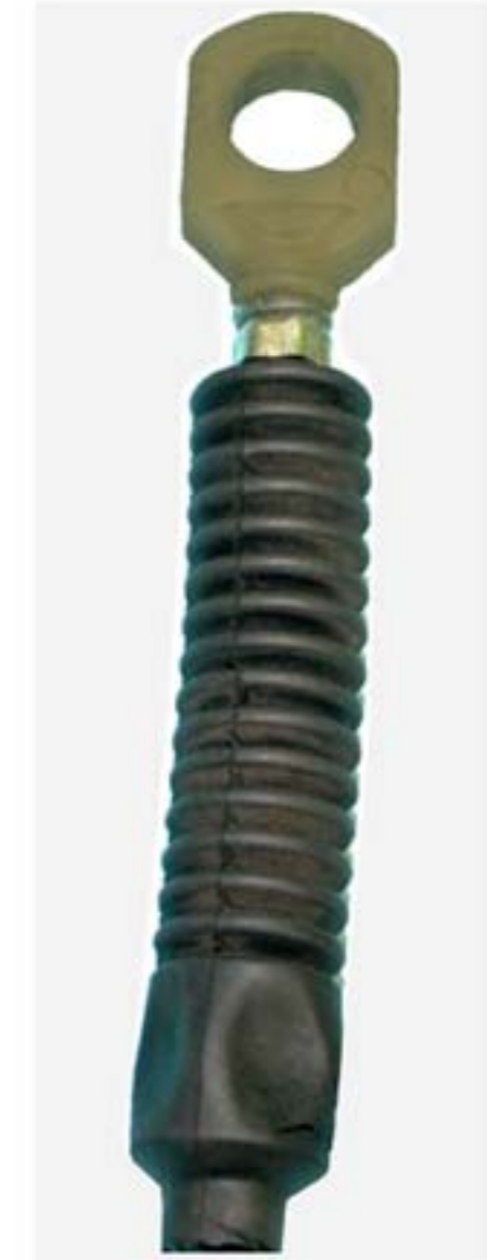
Pictured: MANUAL Gearbox Shifter Cable Bush Housing.