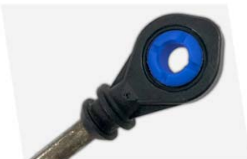
Pictured: DC12-055P bush fitted to housing

NOTE: The bush is a tight fit over the lever shaft to ensure a secure fit.